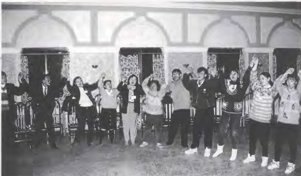
Participants join together in song to close the conference.

On the first night, an international evening provided an opportunity for participants to display their talents and national cultures. On the second night, a special Chinese cultural evening, organized by the head of the Provincial Education Commission, included an acrobatics performance as well as excerpts from the Beijing Opera performed by the leading actor and actress of Heilongjiang