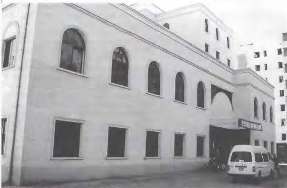
Harbin Normal University International Center, the conference site.

Other officials who warmly greeted the participants were the vice-chairman of the Provincial Education Commission, the president of Harbin Normal University, the head of the International Department