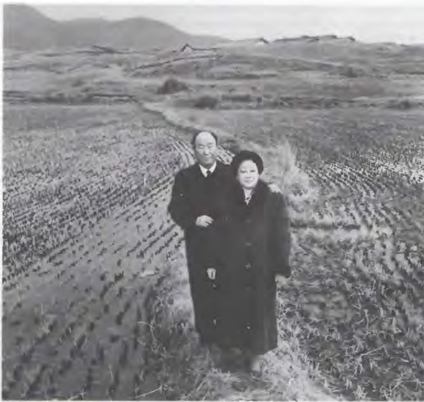
Father and Mother pause for a moment in the rice fields, which used to belong to Father's family. The mountain on which Father received the revelation of his mission from Jesus is in the background.

The issue was not one of oxen, but that, had she known Father was a person standing in God's position, she might have sold even the house.