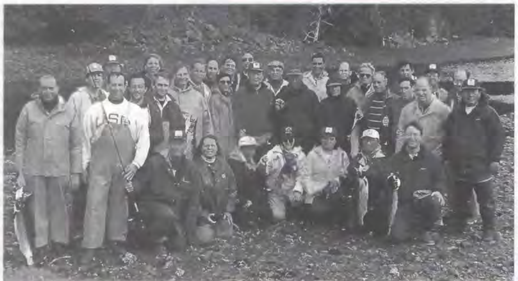
Father and Mother take a moment to pose for a photo with the participants of the lawyers' conference in Kodiak, Alaska.