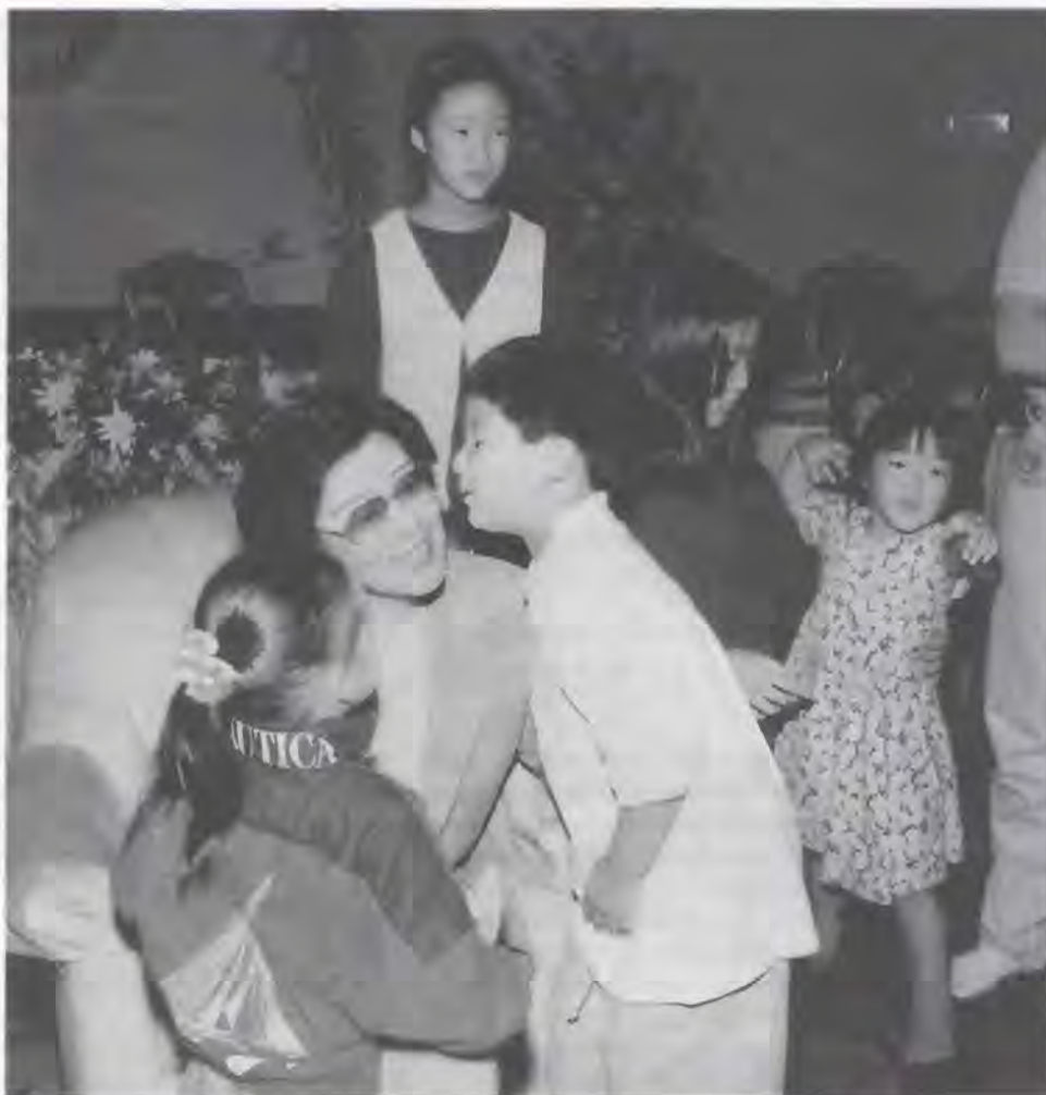
Mother is greeted by the True Children and True Grandchildren upon her Homecoming, September 6, 1994.

Do you know what is so great about the future? Not only will we have Father and Mother but we will have twelve True Children who know Father and Mother's desires and will take the responsibility for moving forward. There is no more stagnation.