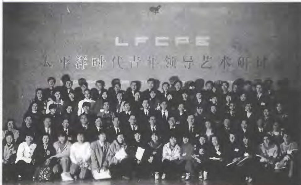
Group photo of conference participants and staff.

A four-hour train journey through a beautiful countryside resembling the Korean landscape brought us to Yanji.